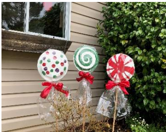
Some crafty Christmas cheer from the SHS Program